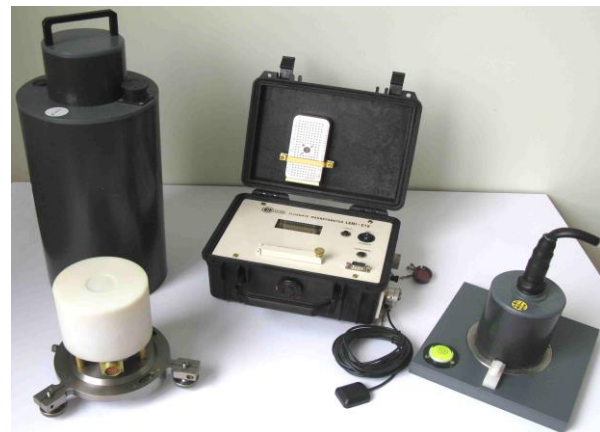
Figure 1: LEMI-018 system with sensor in various options.

KJT Enterprises Inc. 11999 Katy Freeway, Suite 200 Houston, TX, 77079 USA Tel: +713.532.8144 Fax: +832.204.8418 Email: info@KMSTechnologies.com www.KMSTechnologies.com