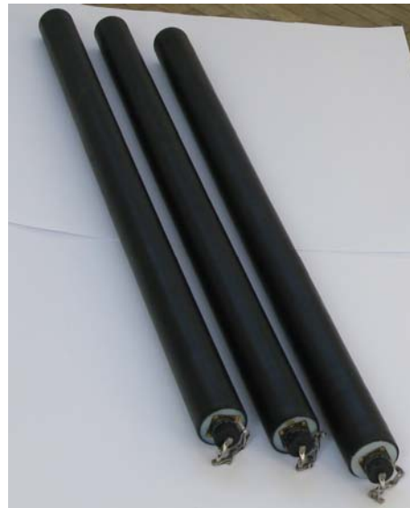
Figure 1: LEMI-118 induction coil magnetometer.

The LEMI-118 induction coil magnetometer is intended for the study of magnetic field fluctuation in the frequency band 1Hz to 70,000 Hz. It can be used both as a part of magnetic measuring system and autonomously with any state of the art data acquisition unit.